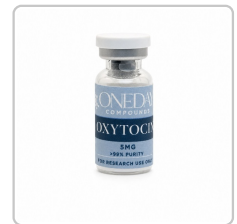
Oxytocin 5mg - OC-OXY5-102