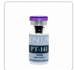
PT-141 10mg - OC-PT10-101