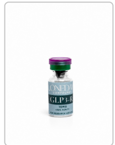
GLP3-R 10mg - OC-RT10-105