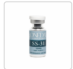
SS-31 10mg - OC-SS31-102