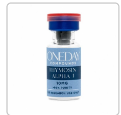
Thymosin Alpha 1 10mg - OC-TA10-101